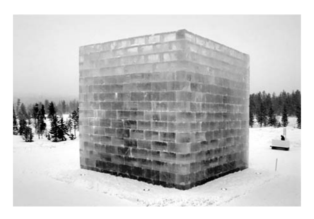
Fig. 5. Labyrinth by Yoko Ono and Arata Isozaki

The last case study is not of a single artist or architect, but of a contemporary exhibition, a contemporary movement, that combines the principles and explorations within sculpture and architecture. For the last three years, seventeen teams consisting of sixty of the top icons in an artist and architecture, from over two dozen countries, have teamed up to create structures in the frozen tundra of Finland. Using eighty percent snow and ice and twenty percent outside materials, for structural or aesthetic purposes. These teams compete in collaborative experimentations, pushing current boundaries in form.