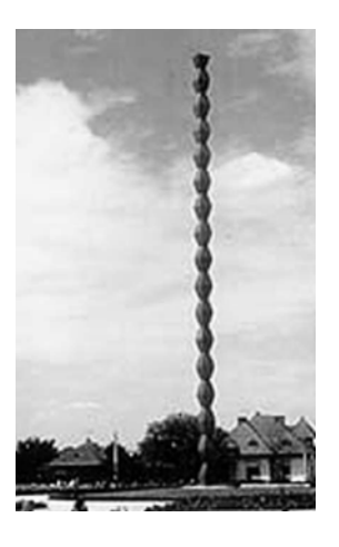
Fig. 3. Constantine Brancusi Endless Column