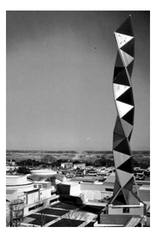
Fig. 4. Arata Isozaki Art Tower Mito

In order to perpetuate his architecture Isozaki's buildings do address programmatic needs. However, through his unique design